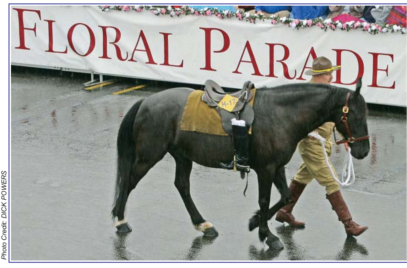
The "Riderless Horse," Pistol, passes down the parade route. The horse is a symbol of those service men and women who will "ride no more." Pistol carried a scroll listing the 3,397 names of the Oregonians who have died in foreign wars over the past century.

The Royal Rosarians hosted a float for the Wartime Rose Festival Princesses from 1942-1945, who were unable to ride in a parade at that time due to a ban on large public gatherings based on the threat of attack. Spectators were especially excited as a WWII-era tank rumbled down the parade route.