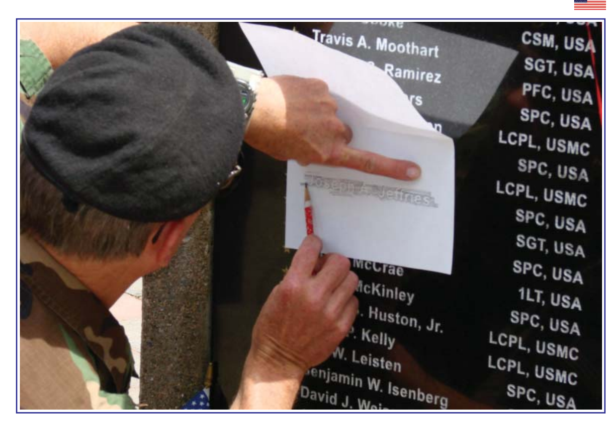
Photos, from left: Diverse groups of people gather near the memorial for the ceremony; The memorial has become a popular source of "rubbings," similar to the Vietnam Memorial; Gold Star families were there to honor and mourn their lost loved ones during the ceremony.

ODVA Attn: Memorial Donation 700 Summer St NE Salem, OR 97301-1285